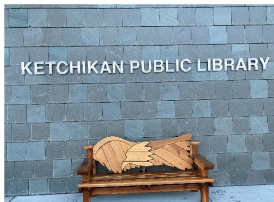
City Building Maintenance refinished the Larry Jackson bench

The woodshop class at Kayhi created two new garden boxes for the Library porch.