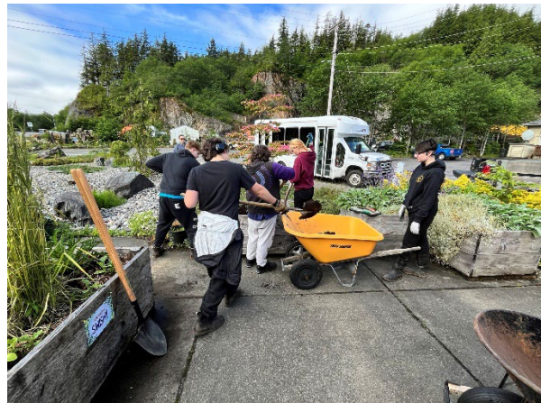
SAIL helped tend the Sensory Garden