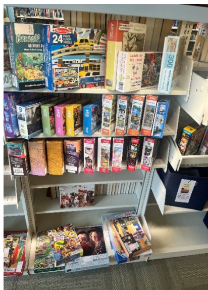
Outreach and Children's Services expanded their popular jigsaw puzzle collections

In 2025 Library patrons checked out physical materials (books, DVDs, CDs, etc.) 103,688 times, up 5% from 2024. The Library conducted its annual inventory of physical collections in February. Of the 60,000 items in the Library's physical collections, 53 items could not be located, half the number missing in 2024.